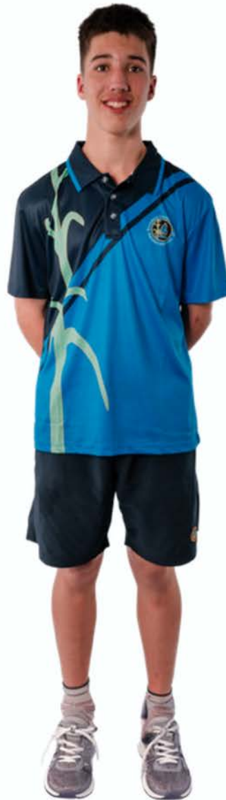
College sports polo shirt