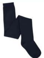
Optional navy blue tights for girls