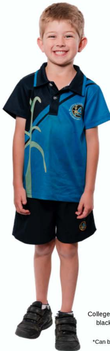
College sports polo shirt

*Can be velcro or laces. No Mary Jane shoes for girls.