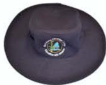
College wide brim hat for Junior School