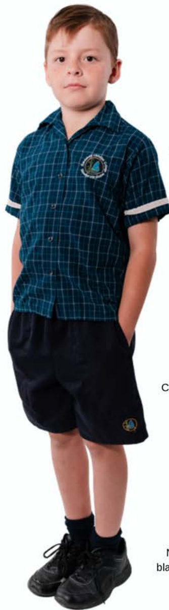
College teal tartan shirt