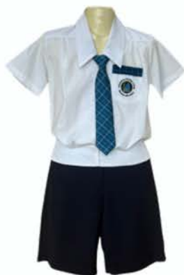
College formal shorts and shirt are an option for girls