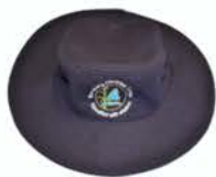
College wide brim hat for Junior School