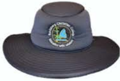
College Middle and Senior School boys formal hat