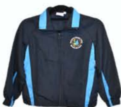
College sports jacket