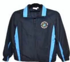
College sports jacket