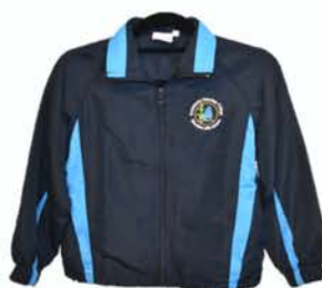
College sports jacket