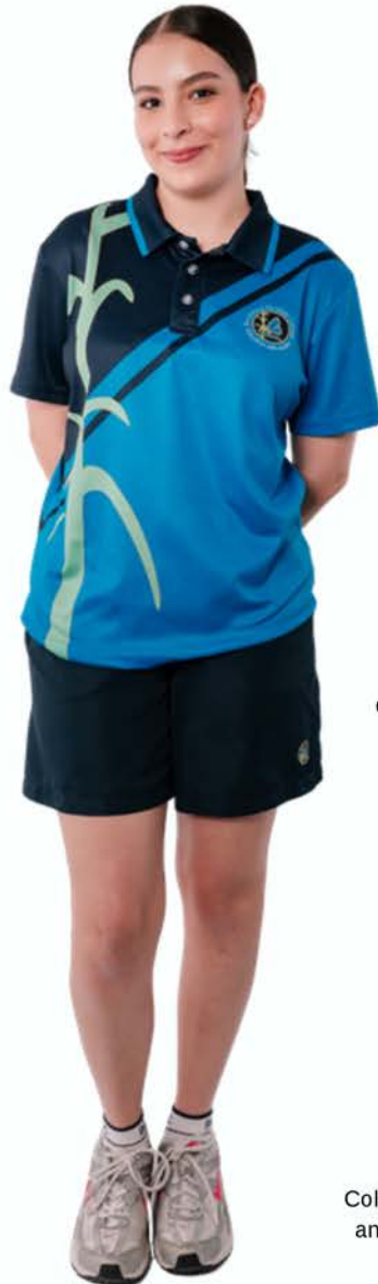
College sports polo shirt