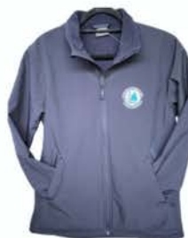
College full zip jacket