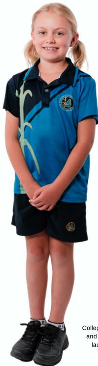
College sports polo shirt