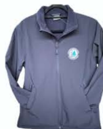
College full zip jacket