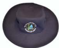
College wide brim hat for Junior School