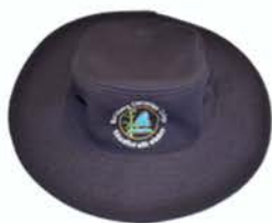
College wide brim hat for Junior School