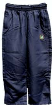
College sports track pants