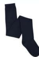
Optional navy blue tights for girls