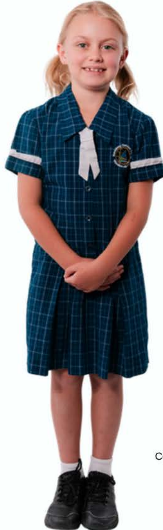
College teal tartan dress