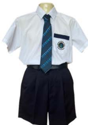
College formal shorts and shirt are an option for boys