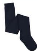
Optional navy blue tights for girls