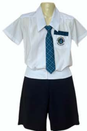
College formal shorts and shirt are an option for girls