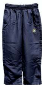
College sports track pants