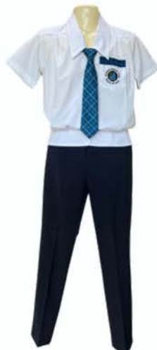
College formal pants and shirt are an option for girls