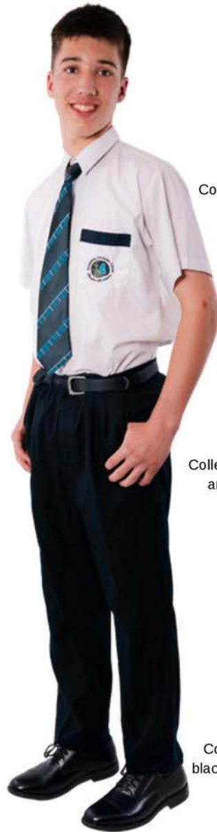
College white shirt