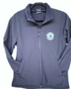
College full zip jacket