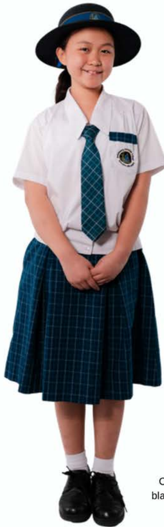
College white blouse