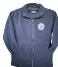
College full zip or half zip fleece jumper