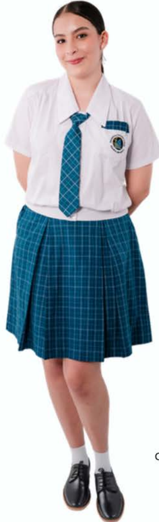
College white blouse