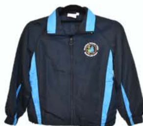
College sports jacket