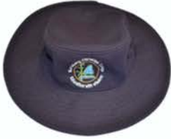
College wide brim hat for Junior School