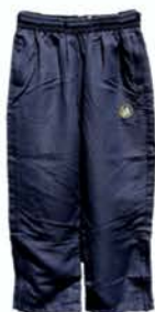
College sports track pants