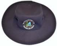
College wide brim hat for Middle and Senior School