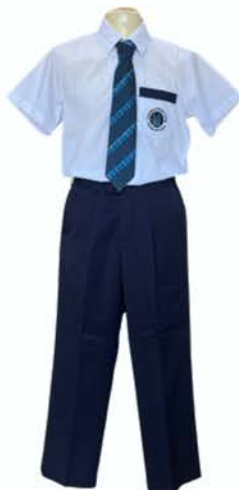
College formal long pants are also an option for boys