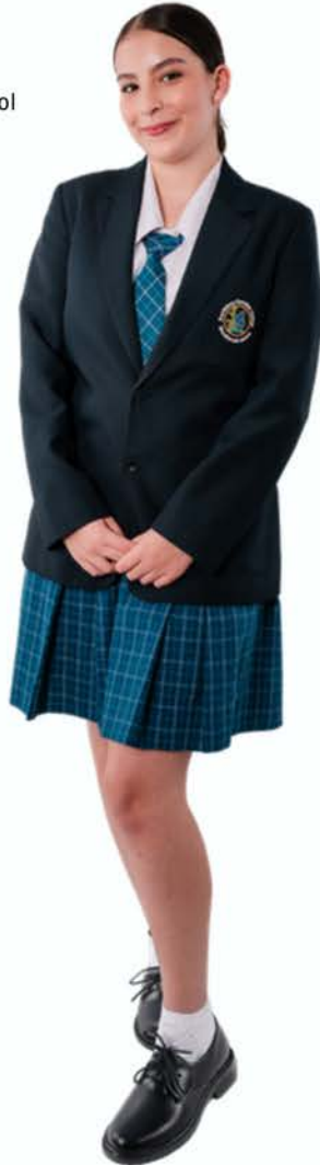
College navy blazer for formal events and cold weather option