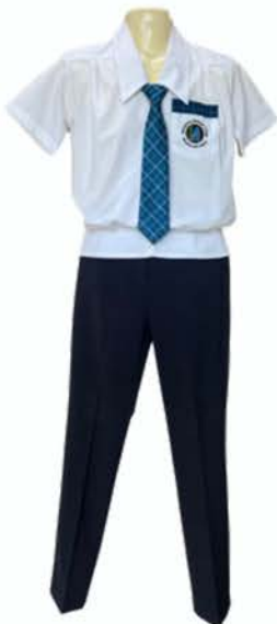
College formal pants and shirt are an option for girls