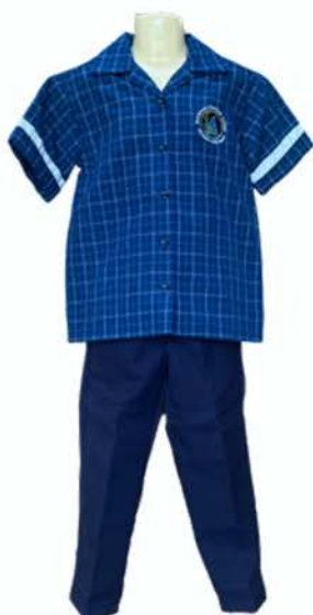
College formal long pants are also an option for boys