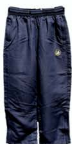
College sports track pants