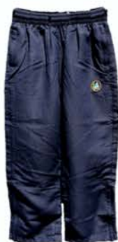
College sports track pants