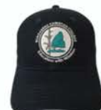
College cap (can be worn while playing sport)