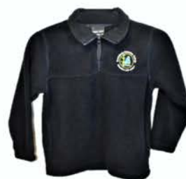
College full zip or half zip fleece jumper