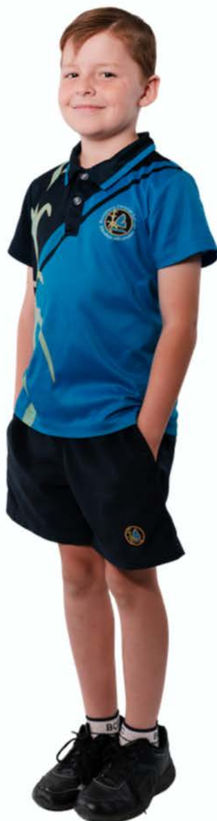
College sports polo shirt