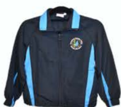
College sports jacket