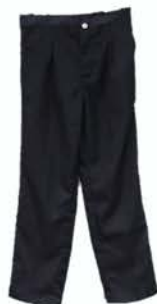
College formal pants and shirt are also an option for girls