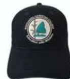
College cap (can be worn while playing sport)