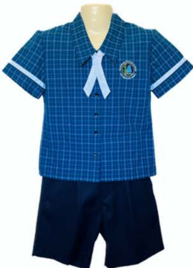
College formal shorts and shirt are also an option for girls