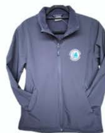
College full zip jacket