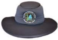
College Middle and Senior School boys formal hat