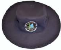
College wide brim hat for Middle and Senior School